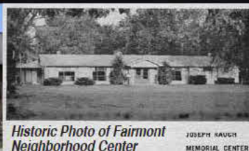
Historic Photo of Fairmont Neighborhood Center