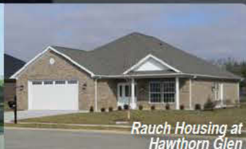
Rauch Housing at Hawthorn Glen