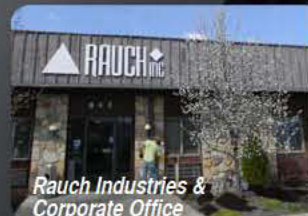
Rauch Industries & Corporate Office