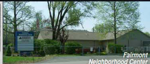
Fairmont Neighborhood Center